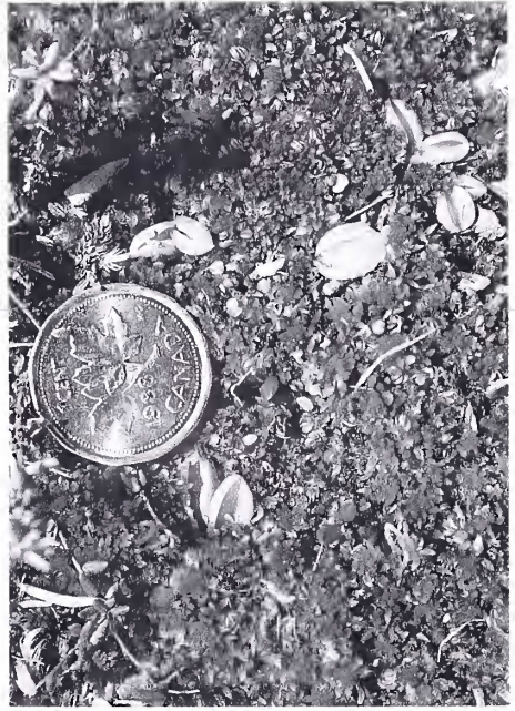
Rosettes with penny for size comparison

mately only a four month growing season. In its natural habitat, P. villosa does not put up its few leaves until late May, followed by flowers in late June. Dormancy and the accompanying hibernaculum formation is achieved by early August. The reason for the early dormancy is that even in the southern Yukon, frost frequently appears by the middle of August.